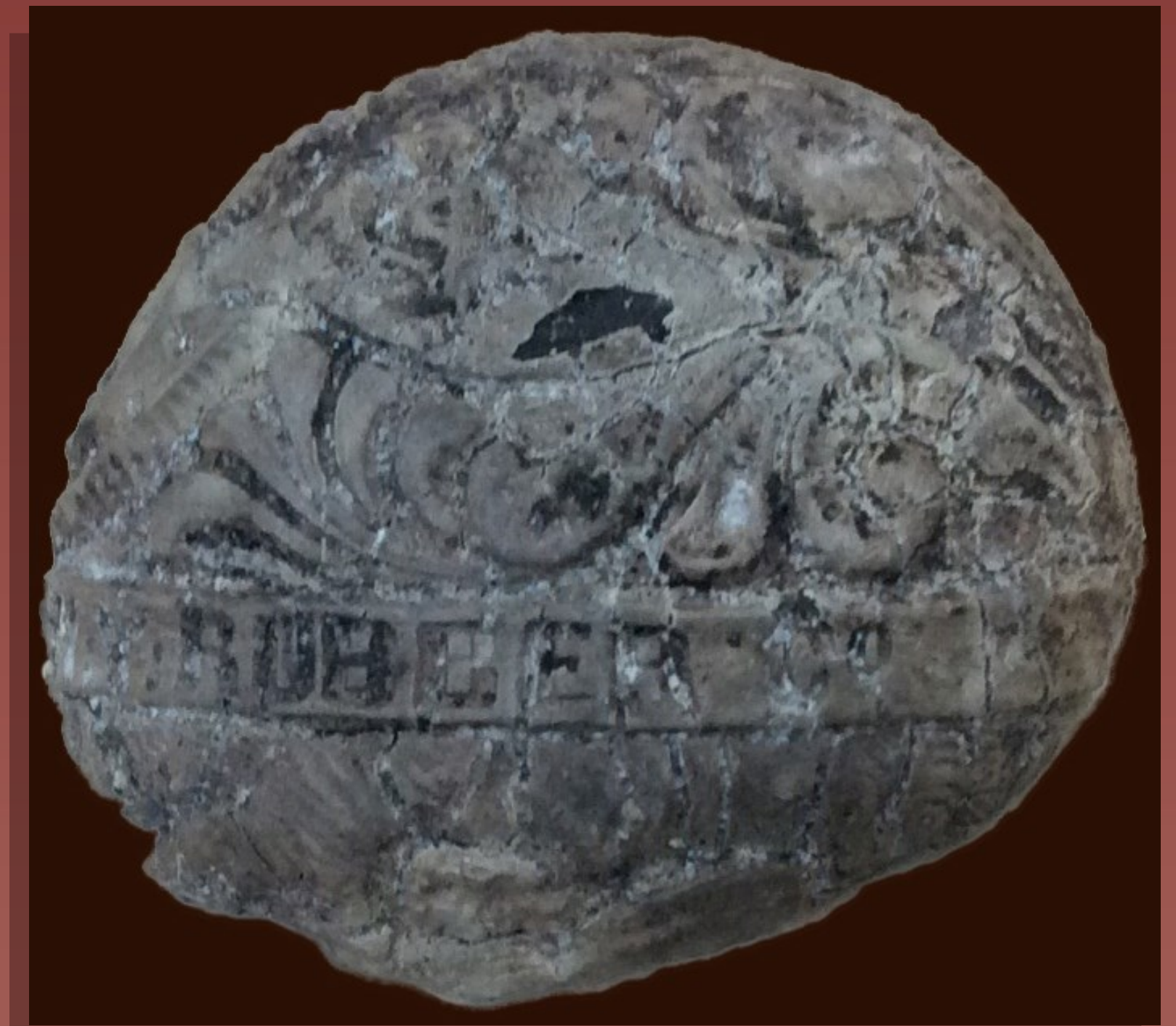
The rubber ball found in the c. 1850-1870 privy had been broken in half, but the manufacturer's name was still visible on the center seam.

Aside from their shape and uses, modern bouncy balls have little in common with this example. Whereas this ball was produced with natural rubber, modern ones tend to use pressurized synthetic rubber which yields a far more elastic ball. While this ball has succumbed to the elements, modern balls are far more resistant to extreme cold and heat. Modern bouncy balls are also bouncier because of their lack of oddities and smoothness achieved by avoiding the traditional technique that the New York Rubber Company used. Despite this, the rubber ball of the 1850s was as much a source of amusement as its counterpart used over a century later.