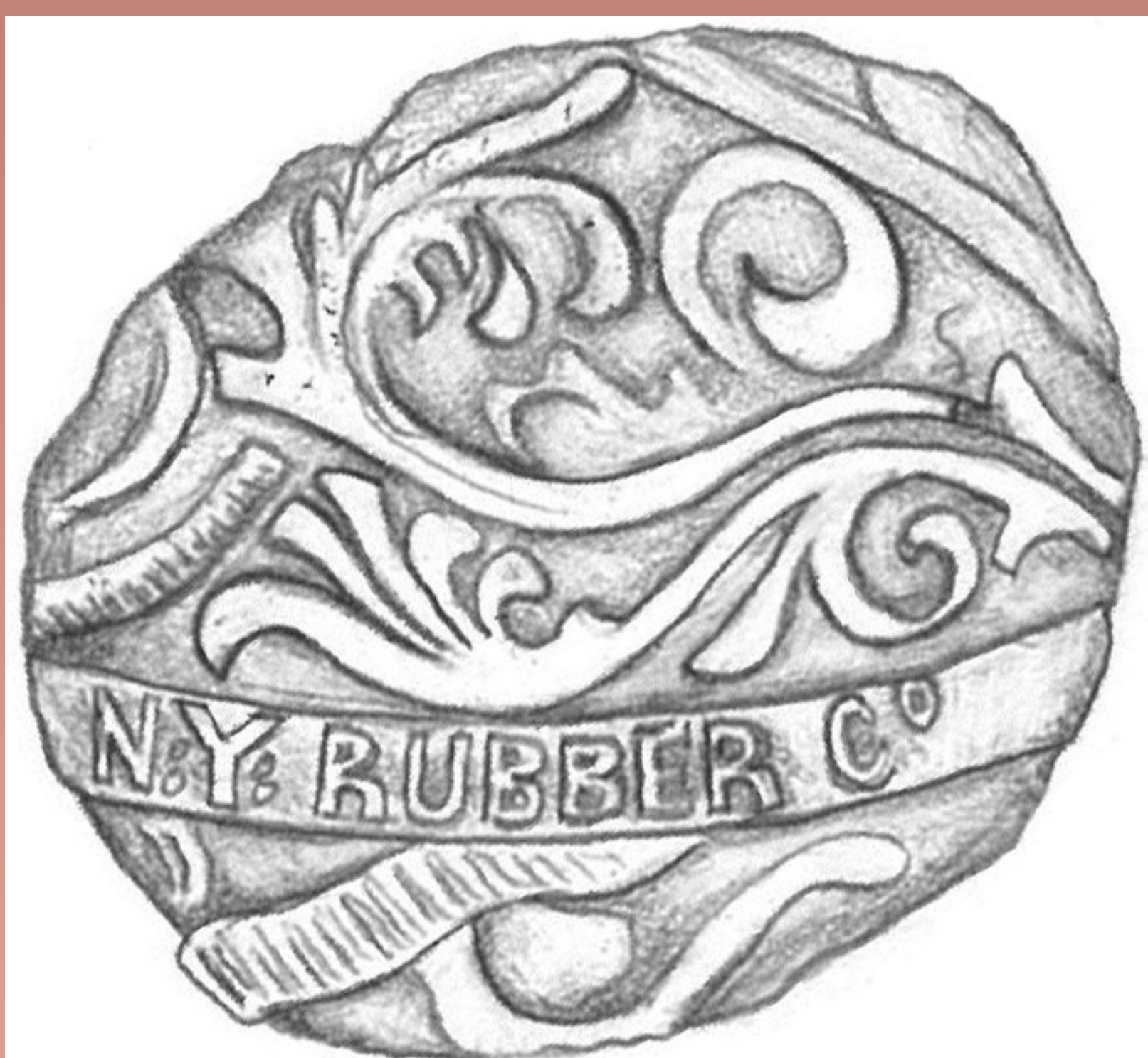
This drawing of the ball shows detail on the ball's surface. Drawing by Alex Glass, Maryland Archaeological Conservation Lab.